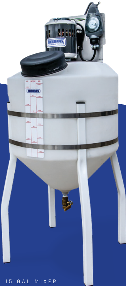
15 GAL MIXER

Consistent doses. Reduced waste. Healthy livestock.